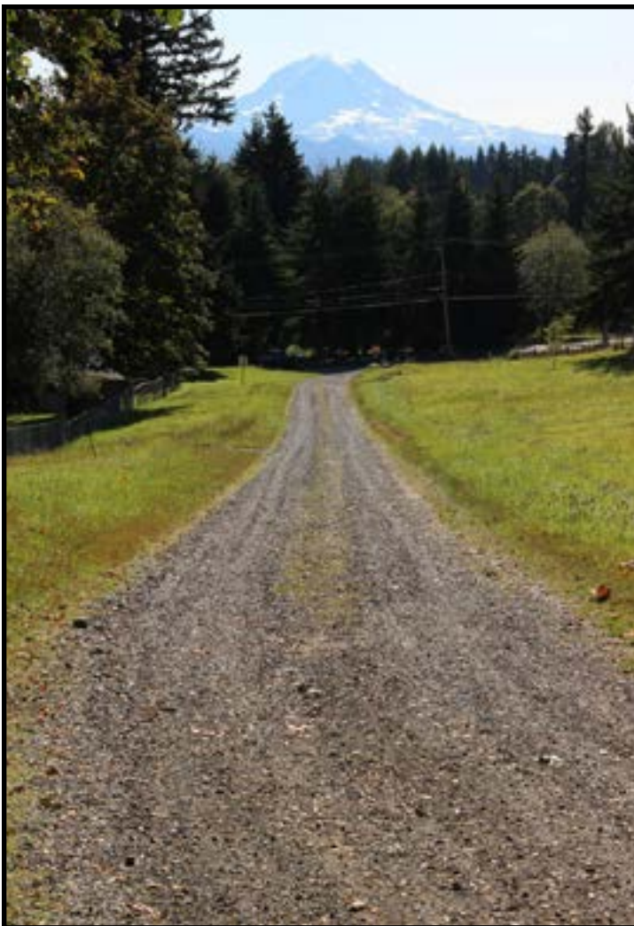
VIEW OF MT. RAINIER ON THE PIPELINE TRAIL

Visit our website: www.piercecountywa.gov/park-projects for additional information about the work we're doing that even a pandemic can't stop! See you on the trails!