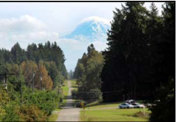
VIEW OF MT. RAINIER ON THE PIPELINE TRAIL

Pierce County Parks is also working in partnership with the National Park Service and other major landowners in the Carbon River Valley, the area between Wilkeson and the Carbon River entrance to Mt. Rainier National Park, to develop the Carbon River Corridor Cooperative Action Plan. The plan seeks to identify opportunities to improve access and recreational opportunities while protecting important environmental and cultural resources through the corridor.