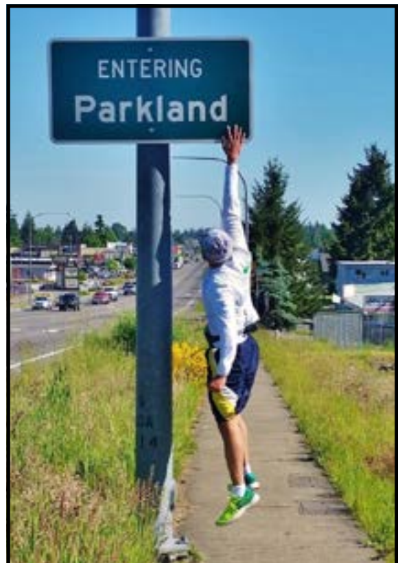
PARKLAND HIGH FIVE